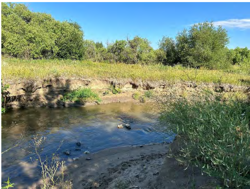
Severe erosion at breakout area-stream is degrading down below claystone level.