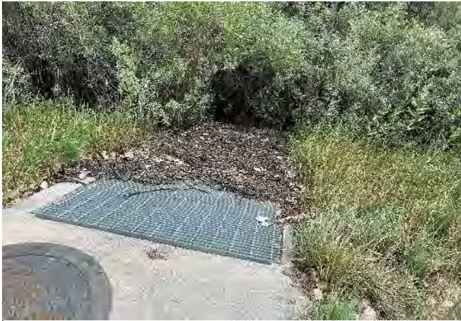
Debris clogging of the outlet structure

Quincy Drainage: Debris clogging was observed at the outlet structure, as were numerous plants growing in the energy dissipators of the outlet structure at the Lakeview Dr. crossing. These plants may need to be eradicated in the next couple of years. CCSP staff will take care of debris removal. At this time, no maintenance or repair needs were identified, except for weed control, although a capital project for stream reclamation may be needed in the future.