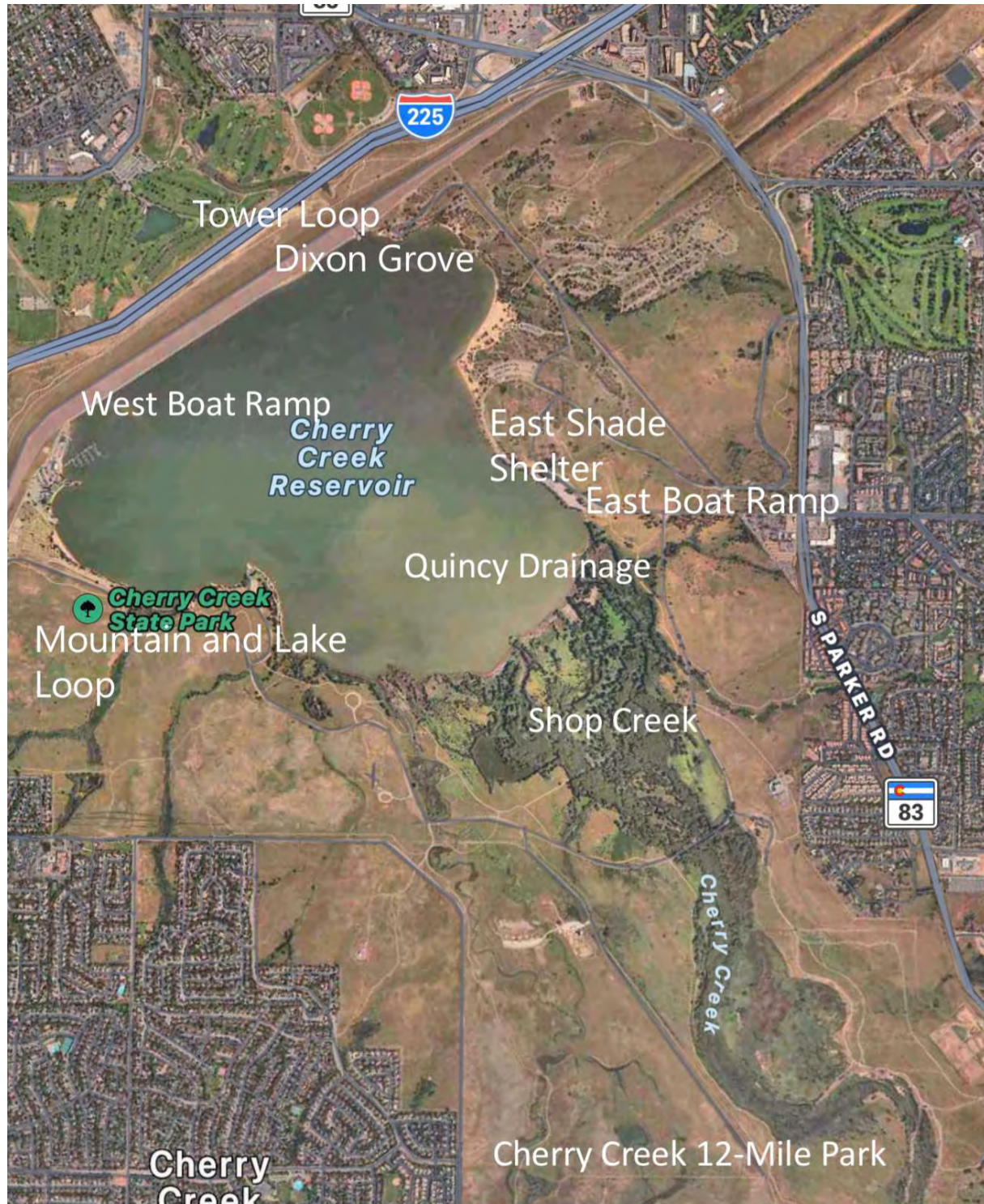
In-Park PRF Locations