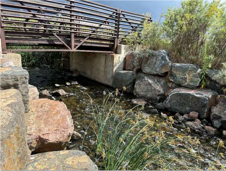
Crossing east of S Cherry Creek Drive and Peoria St. in excellent condition