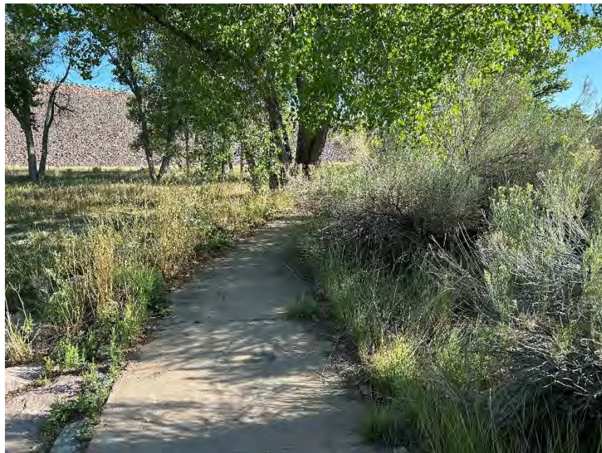
Spot weed control