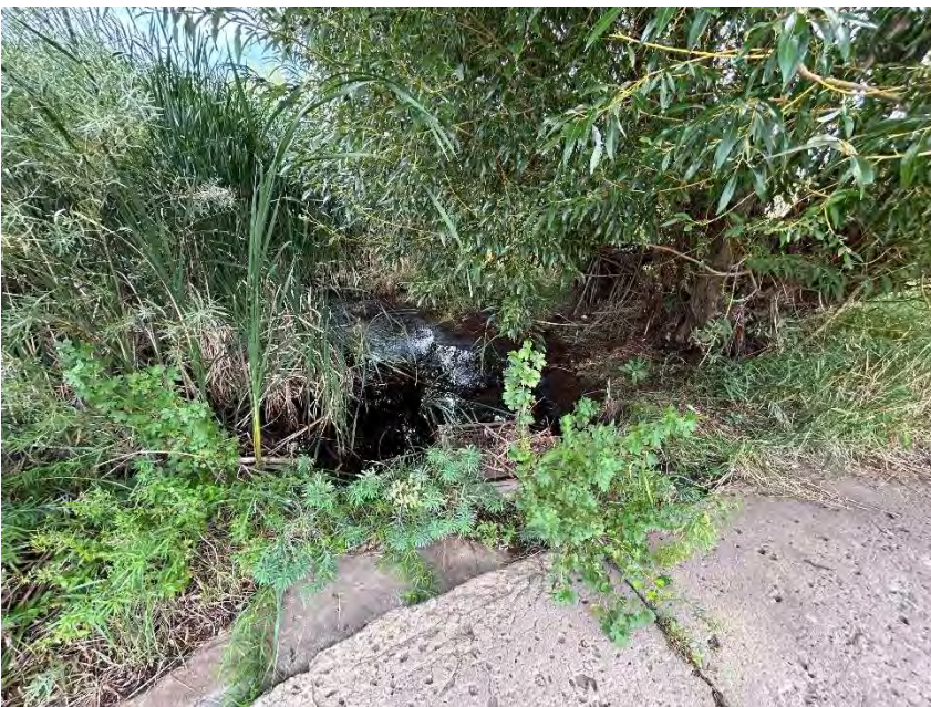
Drop No. 5 Outlet