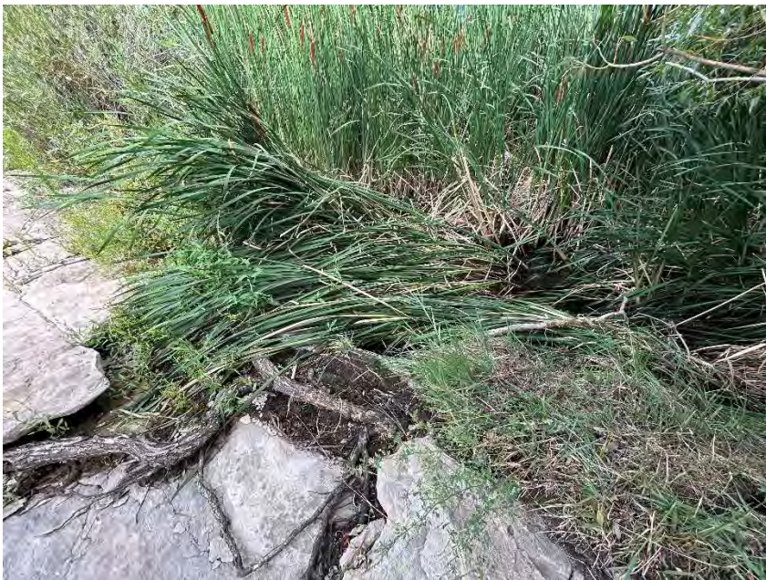
Drop No. 3 Outlet