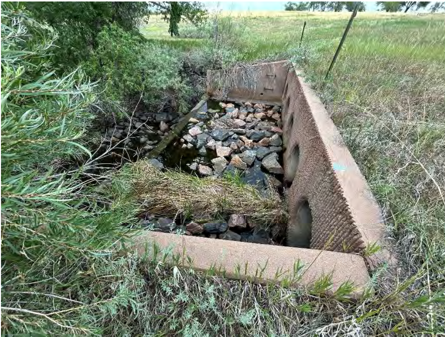
Outlet at Lakeview Dr. becoming clogged with plants