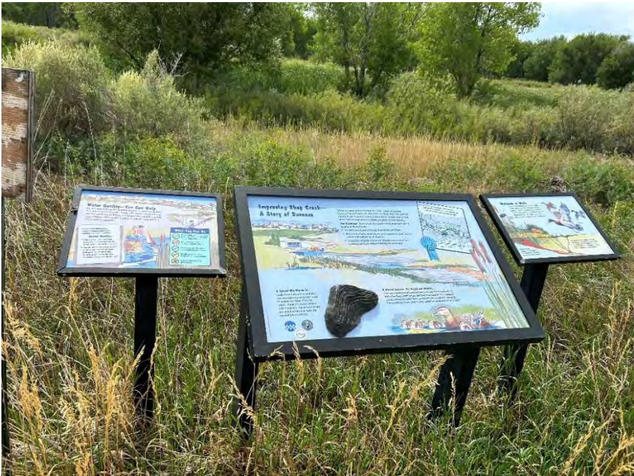
Shop Creek Informational Sign