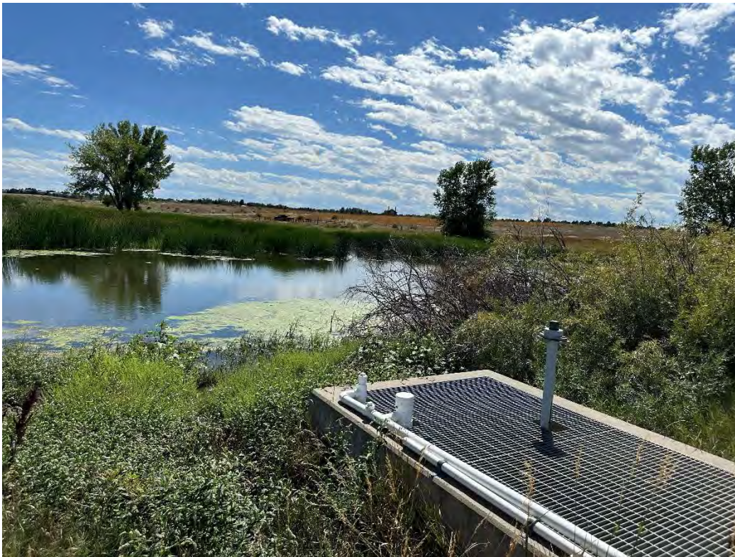
Outlet structure with excessively high water level and clogging of the outlet grates

Cottonwood Wetlands: Aquatic vegetation and cattail debris was observed on the surface of the water. The water level was up significantly at the time of the inspections, principally due to the outlet structure being clogged, and high enough that water was overflowing the access trail. The educational signs were in good shape. Some plant stress was observed from last year's floods and dead areas observed where the higher than normal water surface remained too long. Maintenance recommendation is re-vegetation of the dead areas with some weed control and cleaning out of the outlet structure grate twice in 2025 to maintain normal pond operating levels.