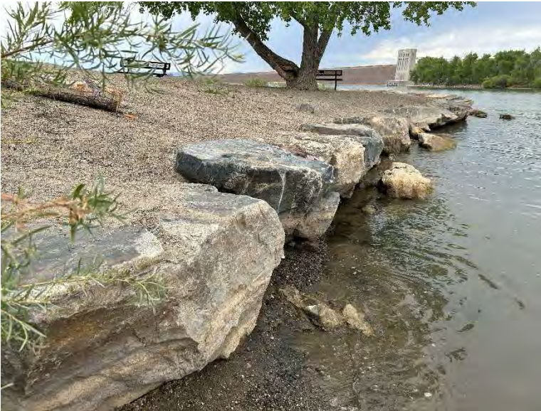
East Shore of Stabilized area showing the beginnings of boulder undercutting

Dixon Grove: Boulders and riprap serve as protection of shoreline for this PRF. There is a water quality capture area that treats runoff from the parking lot that is appearing to function very well. The only maintenance needs that were identified was some spot weed control. The east shore of the large promontory appears to be beginning to be undercut, and should be considered for a future project. An area of shoreline south of the west shoreline stabilization area could also be a good candidate for a future shoreline stabilization capital project. Various dead trees and debris from the floods were identified for CCSP maintenance.