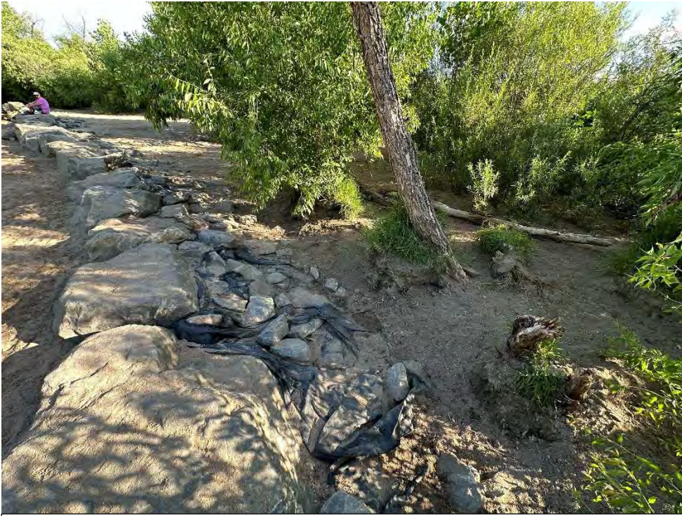
Severe erosion behind boulder edging just before the beach area.