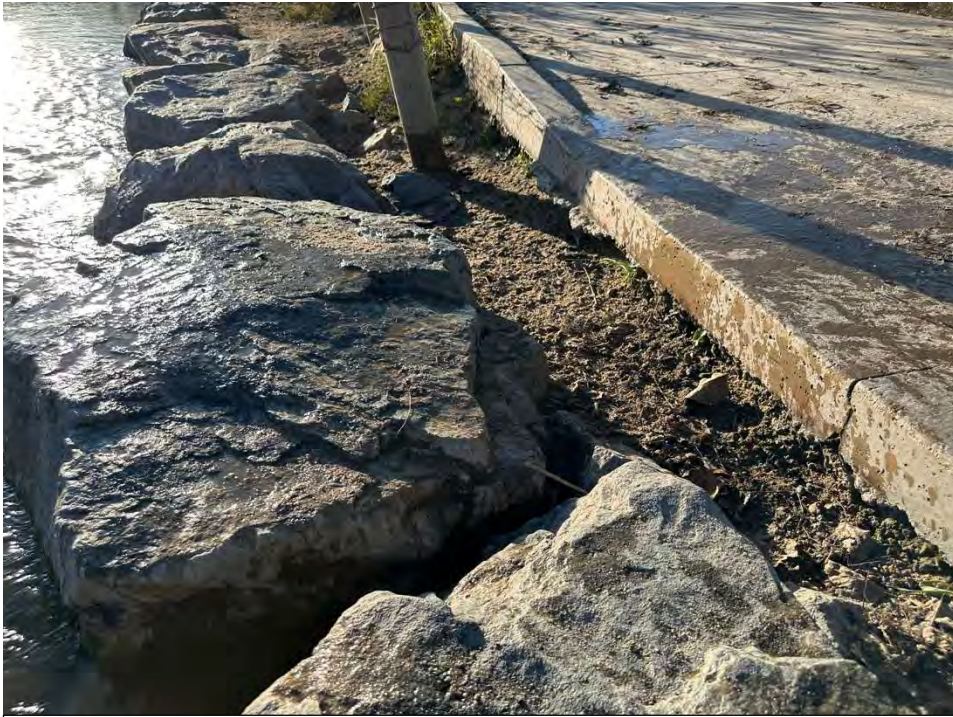
Erosion behind boulders undercutting trail.