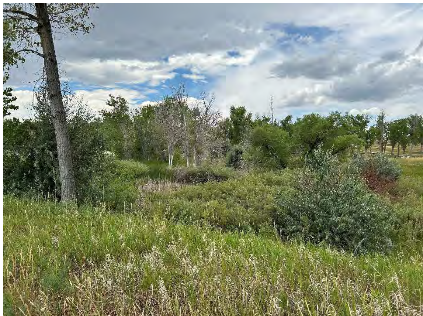
Vibrant water quality capture area