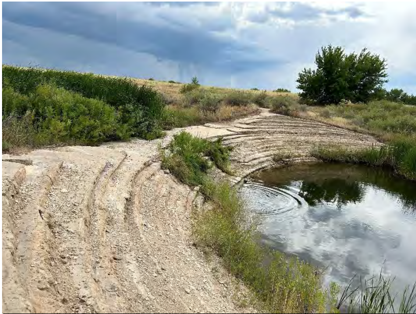
Drop No. 4