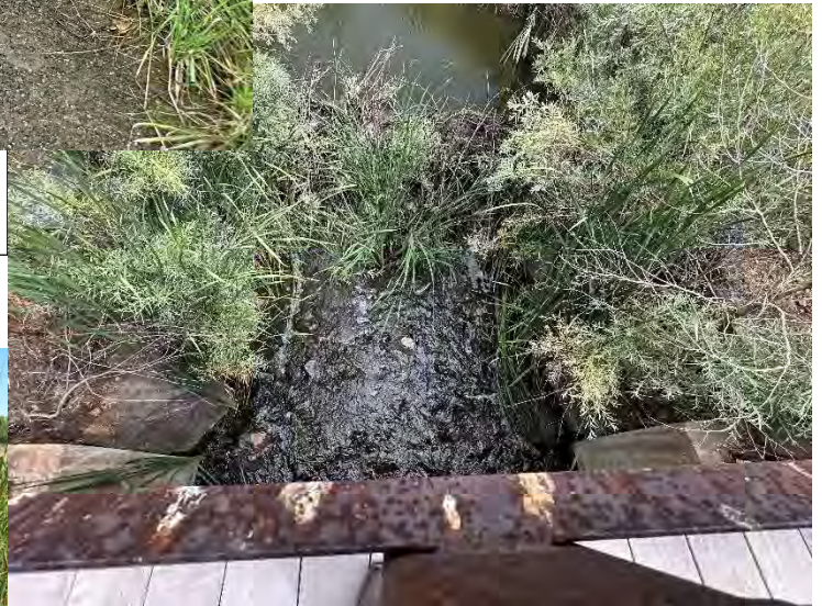
Vegetative debris blocking stream channel