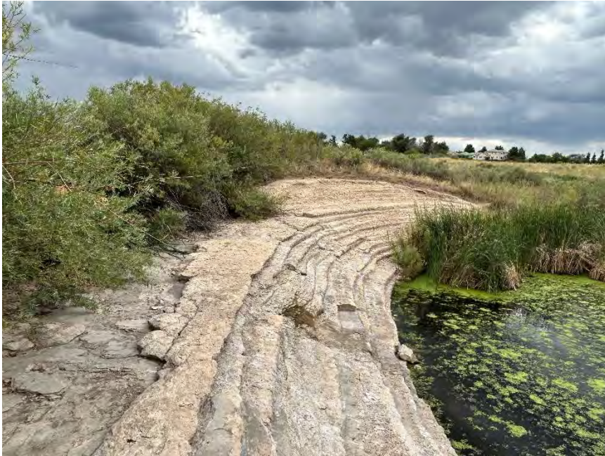
Drop No. 2