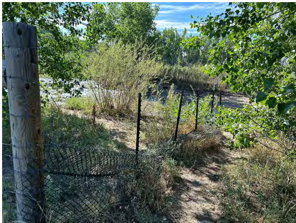
Failed revegetation from Phase III project- will be part of repair project for 2025