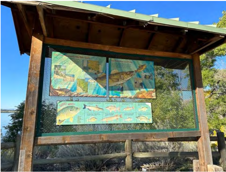
Informational sign in good condition

Tower Loop: This PRF consists of boulders and riprap stabilization of the shoreline. No new maintenance items were identified from that identified in the 2023 inspection, which was minor backfill of the boulder edging on the fishing promontories. That repair is under contract, but hadn't been done as of the date of this 2024 inspection. Some boulders were displaced but probably by human hands for seating purposes. The informational sign was in good shape and in no need of attention. The only maintenance identified for this project was some weed control.