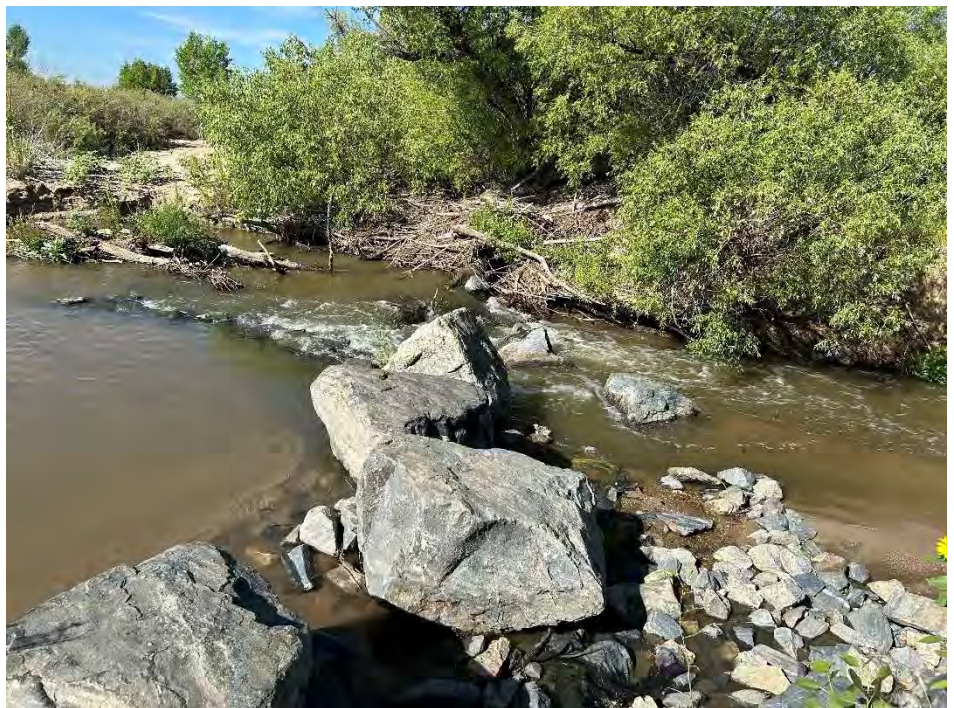
Severe erosion at breakout area