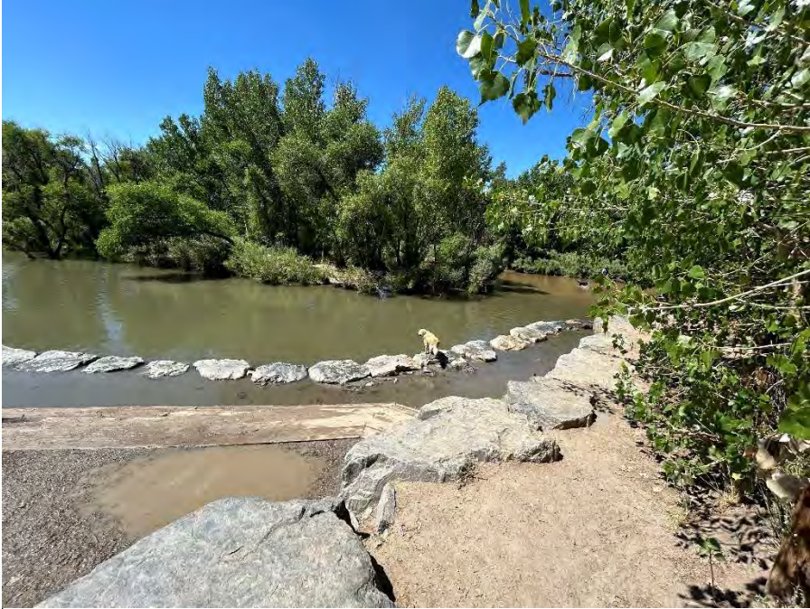
Behind-the-boulder edging erosion at the Fourth Access Point