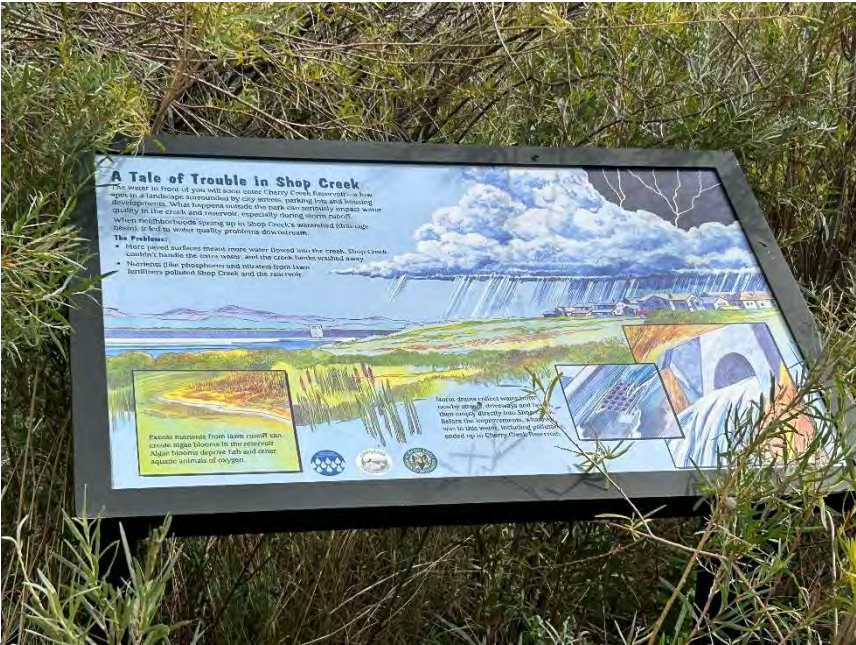
Shop Creek Informational Sign