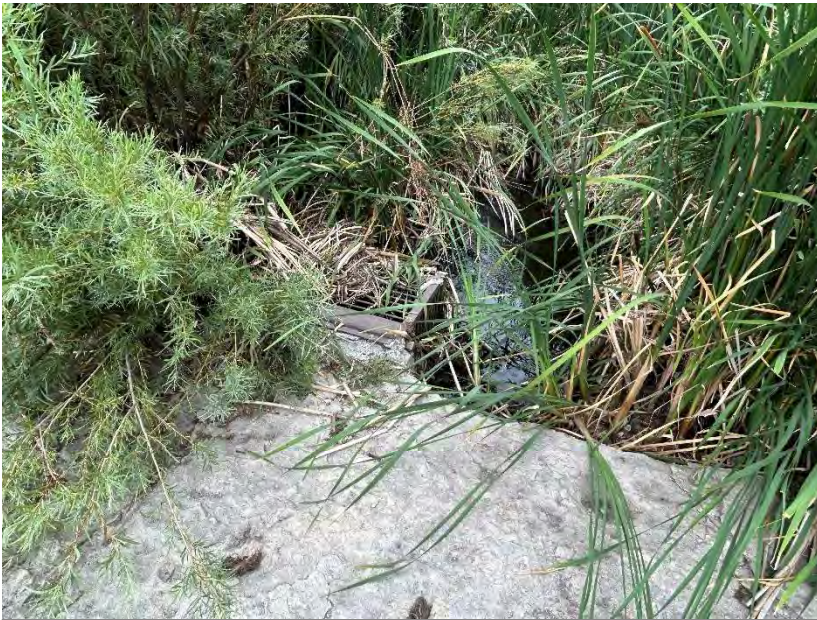
Drop No. 2 Outlet