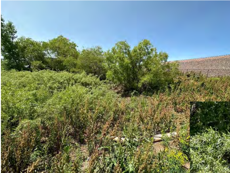
Outlet clogged with plant material

West Boat Ramp: All maintenance for this PRF is the responsibility of the CCSP. Maintenance identified for CCSP was cutting and clearing of all the vegetation inside the bounds of the pond, especially at the outlet.