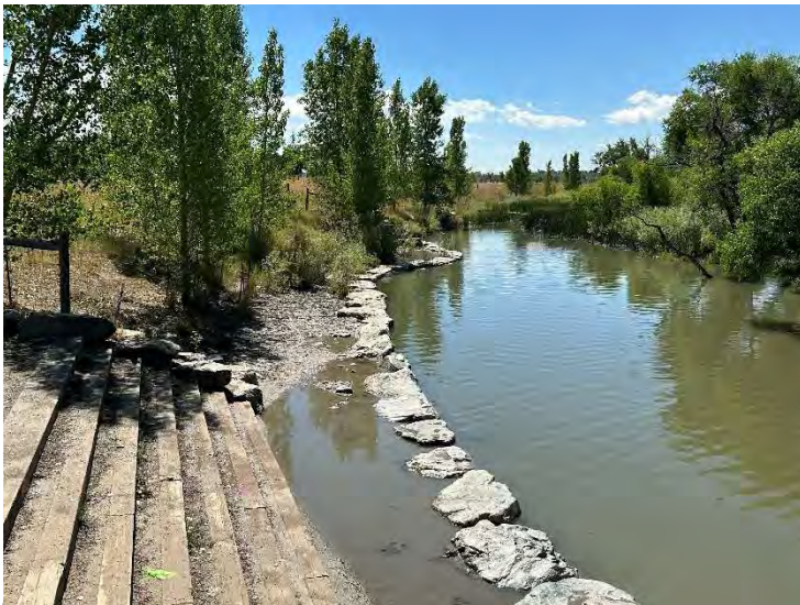
Behind the boulder edging erosion at the base of the stairs of the third access point-repair project for 2025

created by the 2023 floods. As this logjam appears to be acting like a natural grade control structure, we are recommending that it be reinforced to allow it to continue to act as a grade control structure in the future. The erosion behind the boulder edging where the concrete trail abuts the boulder edging is severe enough that the trail undercut areas should be grouted to protect the trail. The rest of the damage will need to be rectified in near-future stabilization projects. The displacement of the “breakout” area is, perhaps, the most significant area needing stabilization attention, as well as the lost boulder edging downstream of Access Number 4. The entire area upstream of the grade control structure has suffered extreme bed erosion to such an extent that tree islands 2-3 feet high have been created. It also appears that the main channel has deviated from previous years. Of additional concern is whether stabilization of the east bank of Cherry Creek with the boulder edging is actually creating an off-set destabilization of the stream bottom and even of the west bank. All of this indicates that a serious re-evaluation of the original design concepts should be done to determine their functionality and applicability to stabilizing or reclaiming a stream that is constantly changing its course and if some alterations of prior designs should be effected to