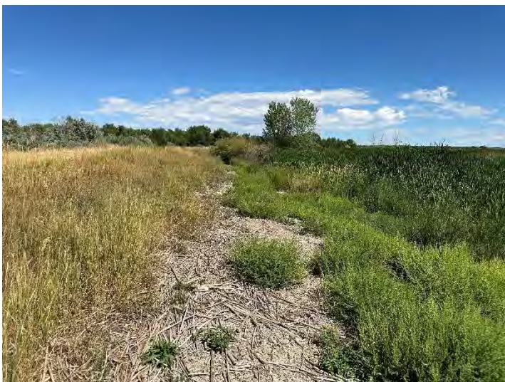
Weeds growing in dead areas created by excessively high water levels