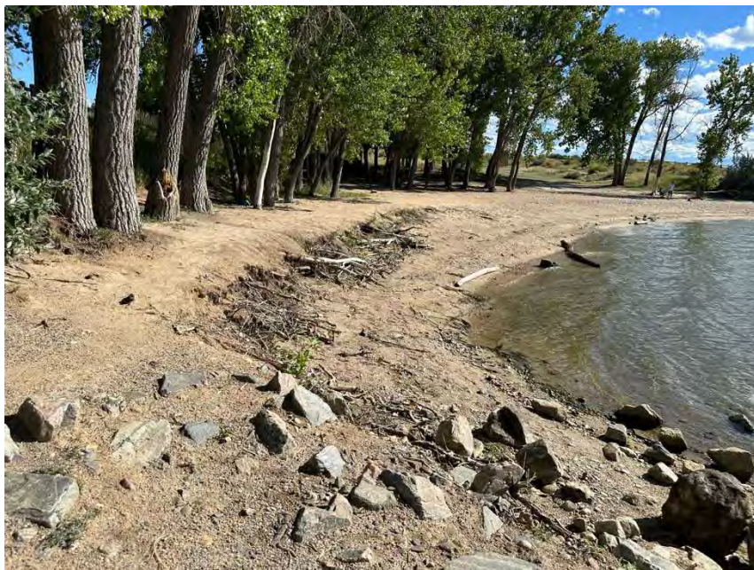
New area SW of the existing PRF originally contemplated for a shoreline stabilization project, but