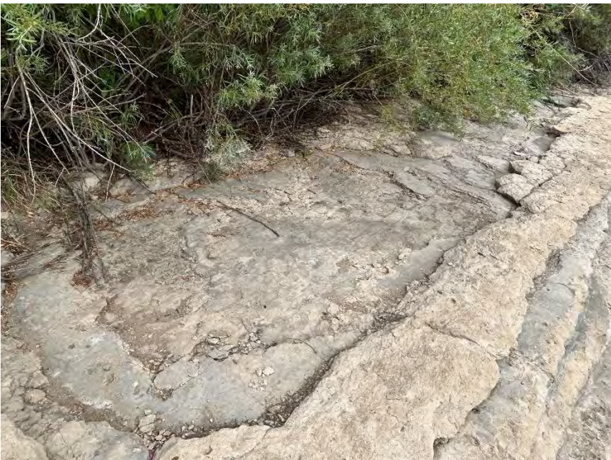
Drop No. 1 outlet structure overtopped and clogged with weeds