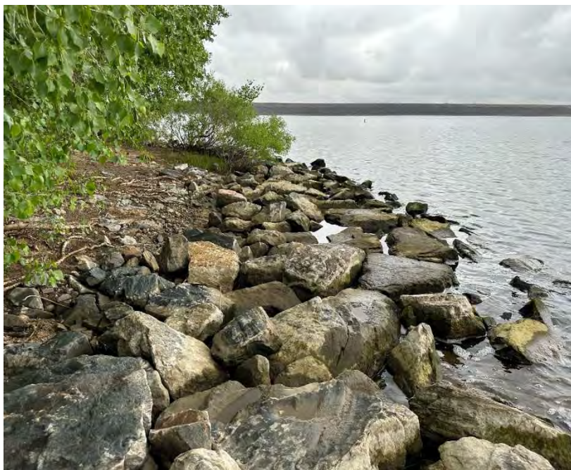
Current condition of shoreline stabilization