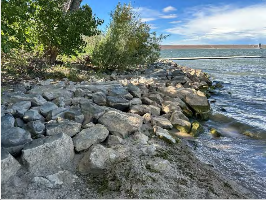
Shoreline riprap in good condition

Mountain and Lake Loops: Boulders and riprap serve as protection of the shoreline for these facilities. As about 100 feet of shoreline southwest of the existing PRF has been eroding and exposing tree roots, a shoreline stabilization project was developed in 2022 for construction this year to be added to this PRF. The Authority decided, however, that the project should be put on hold due the low return on phosphorus stabilization. Bank erosion above the normal high-water line and trail material erosion was caused by overland flow from the floods running to the reservoir. The bank erosion should be monitored and CCSP should regrade the trails. No Authority maintenance needs were identified.