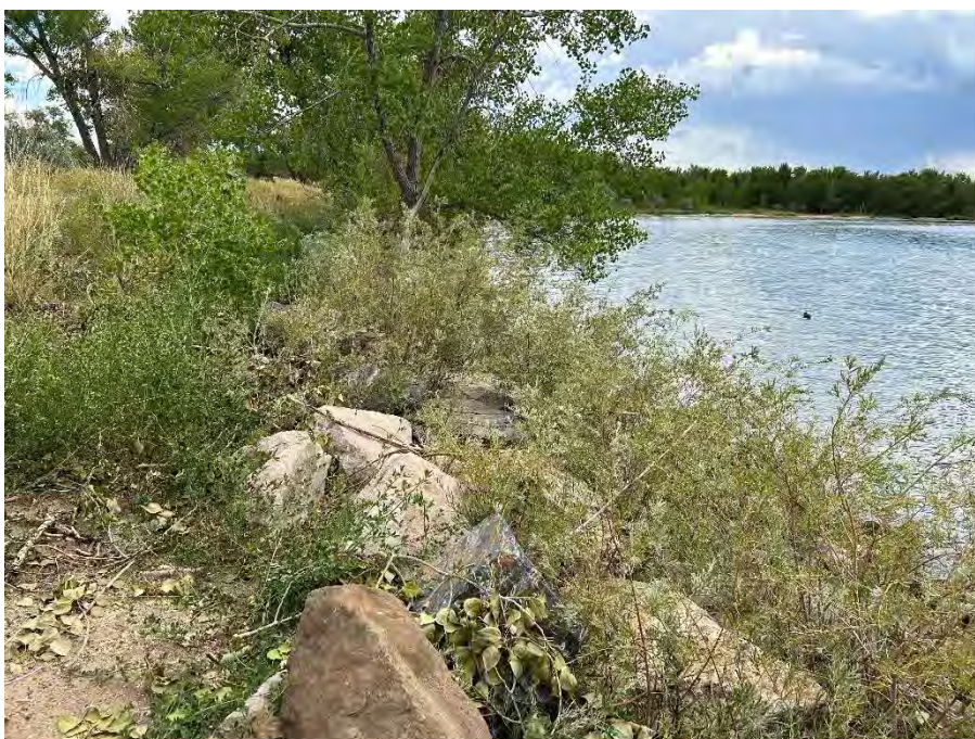
Area south as candidate for future Shore Stabilization CIP project