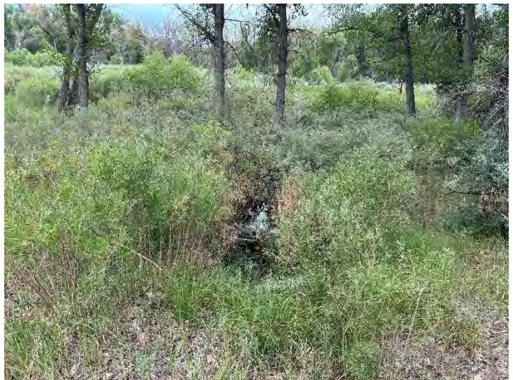
Outlet of the outlet structure