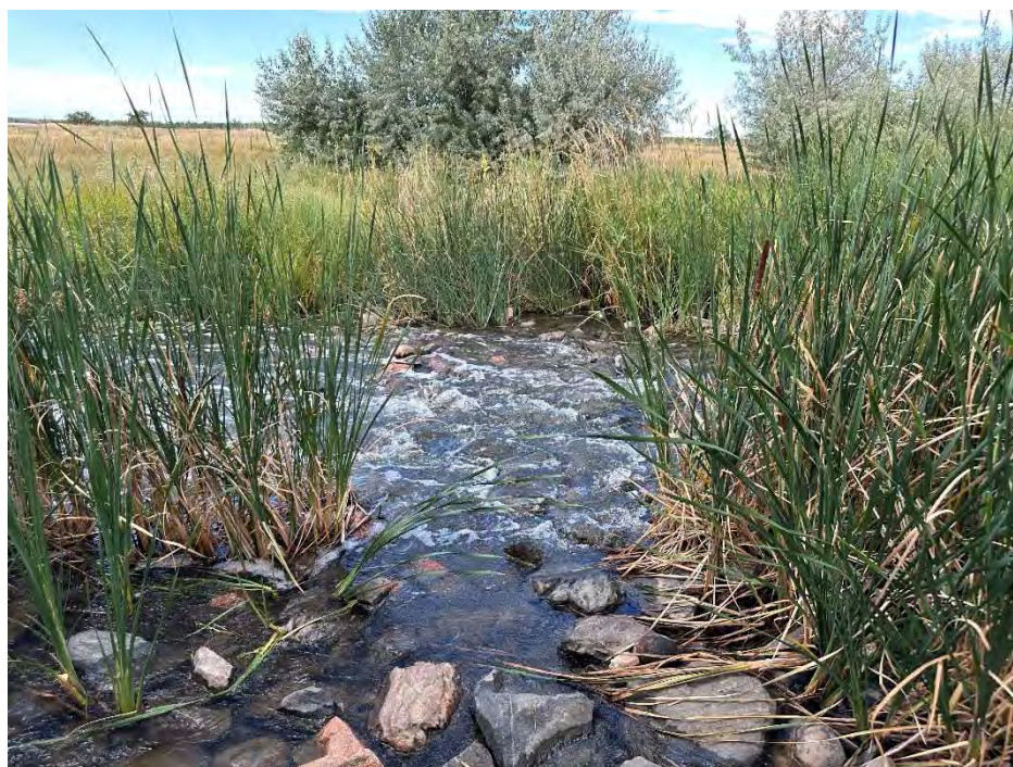
Riffle structure downstream of confluence with Lone Tree Creek