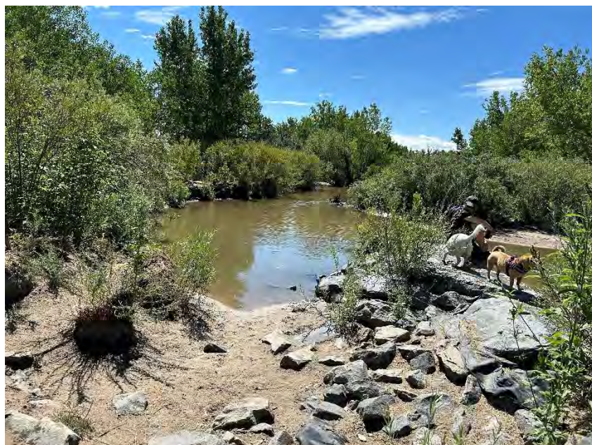
Beginning of beach area- severe erosion behind the boulder edging starting a second channel behind the boulder edging