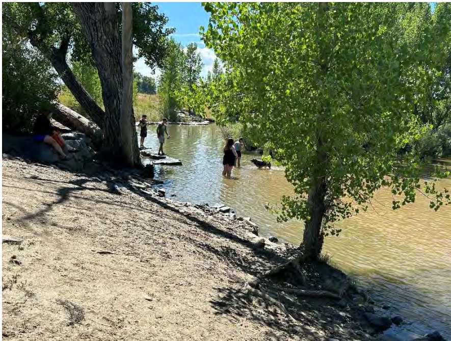
Boulder edging erosion just below Fourth Access Point

repair the damaged areas rather than simply repairing the damaged areas back to the way they were originally designed.