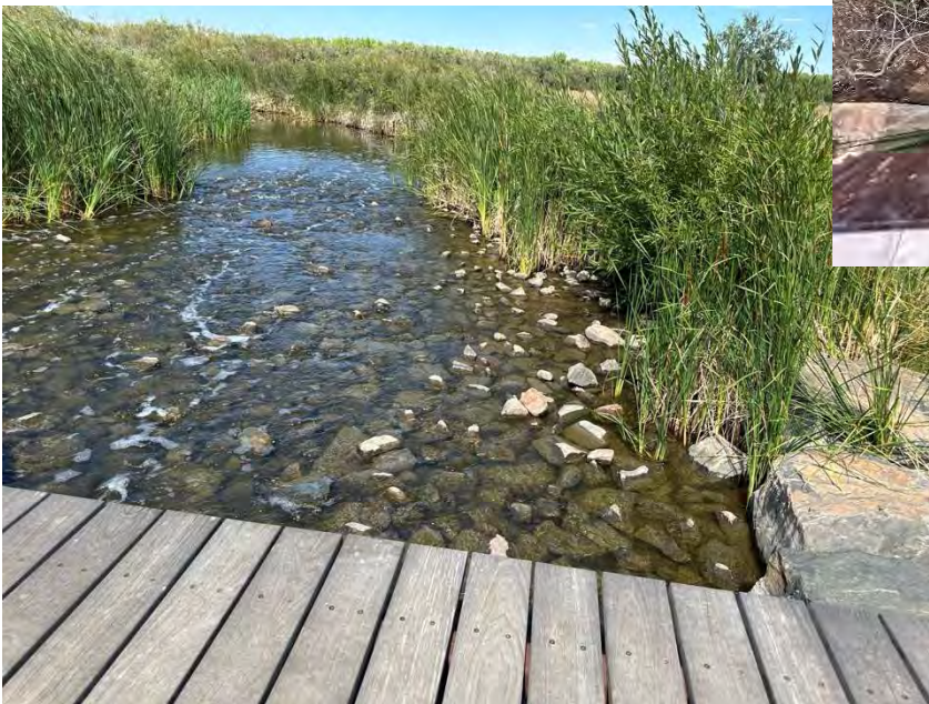
Riffle structure at lowest trail crossing in excellent condition