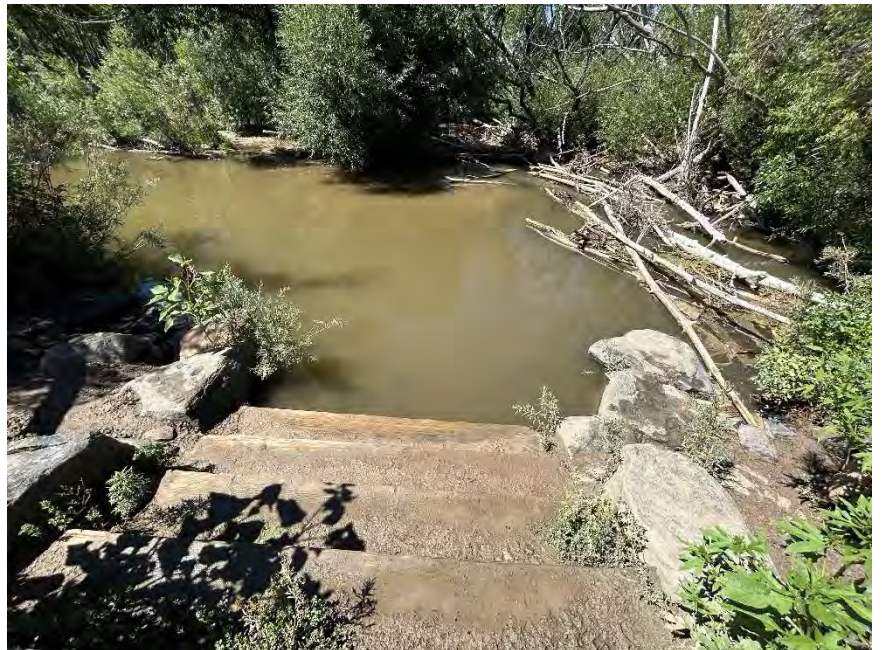
One more edge-boulder missing from last year at bottom of steps. Logjam is acting as a natural grade control structure