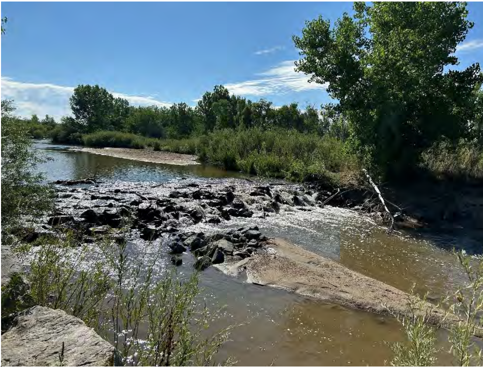
Grade control structure continued to work well-some of the riprap that has washed downstream will be relocated back to the structure as a repair project for next year