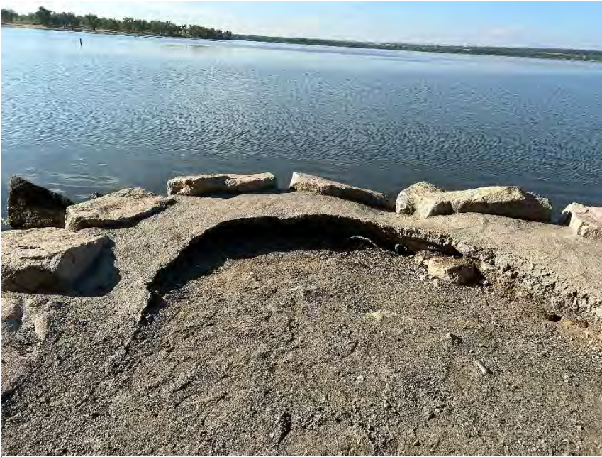
Eroded material from behind the grout at the fishing promontories-will be backfilled yet this year