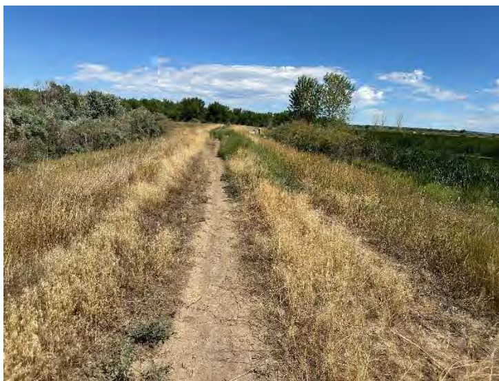
Wheel-tracking from last year's harvesting activities regrown well except for social trail