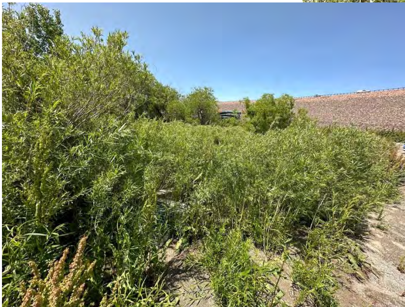
Total facility clogged with plants