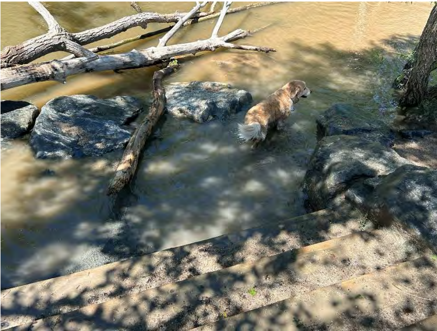
Boulder edging erosion below Access 4. Also sediment deposition almost to the level of the original boulders.