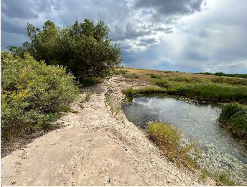
Drop No. 3