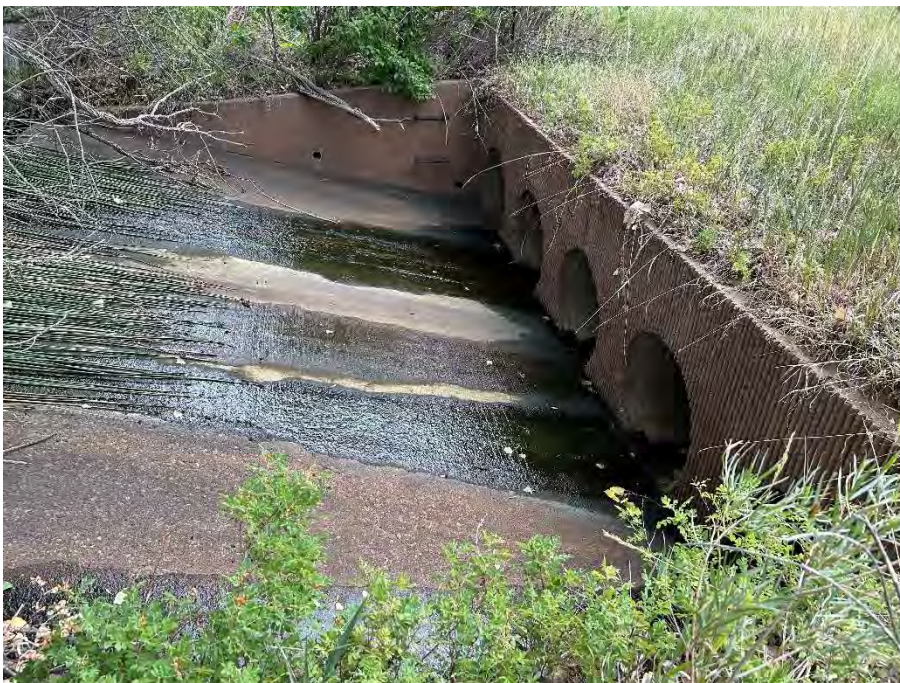
Inlet at Lakeview Dr. is clear