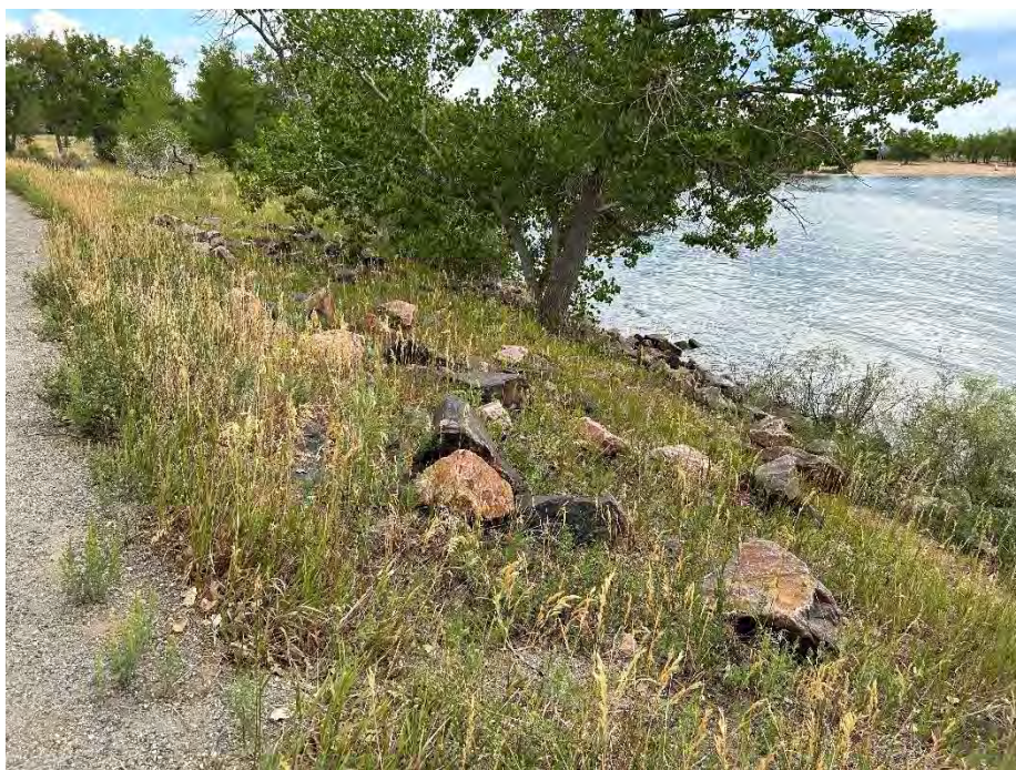
Area south as candidate for future Shore Stabilization CIP project