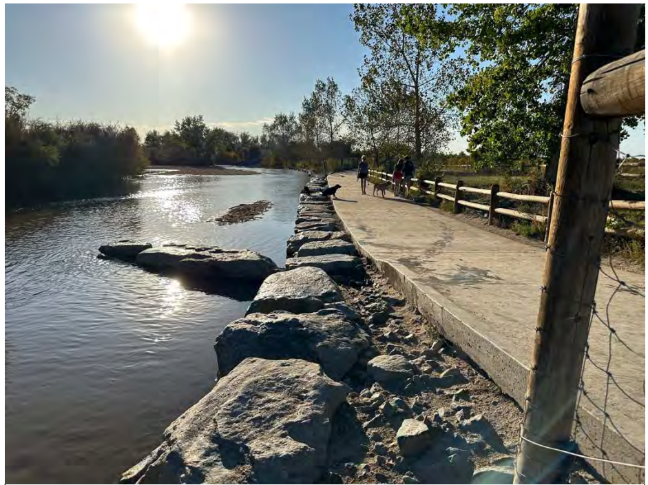
Erosion behind boulders undercutting trail.