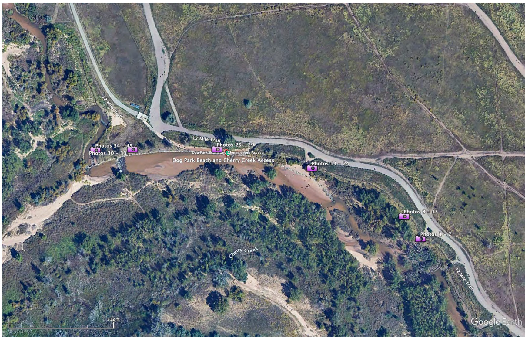
Figure 1. Area visited during August 27, 2024 site visit (Note: photographs in appendix are generally organized from upstream to downstream (right to left in this image))