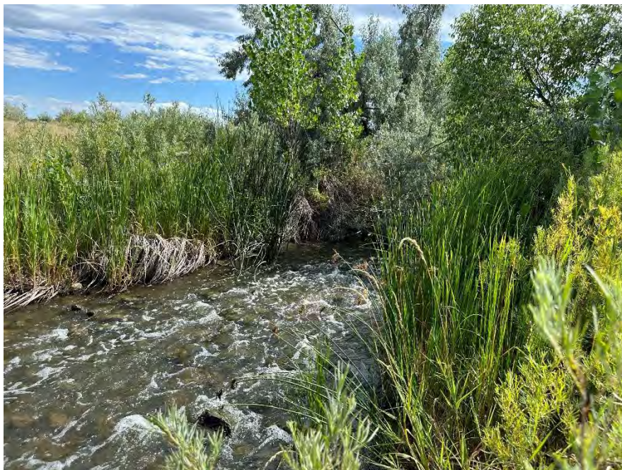
Riffle structure near old Cottonwood alignment and shooting center