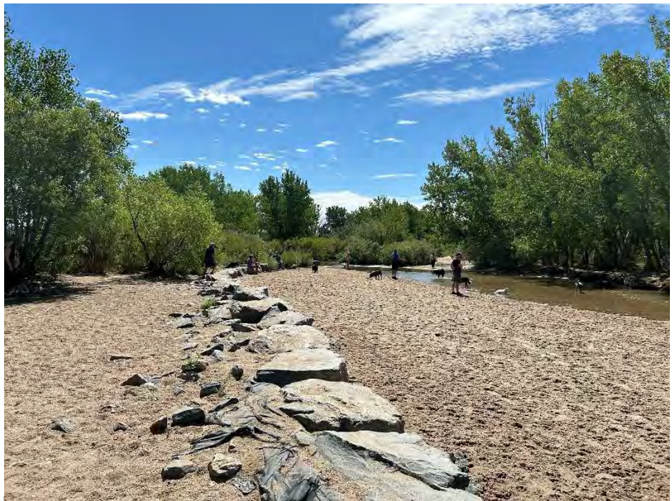
The boulder edging is now a spine, away from the water and the high point of the bank, with beach on both sides, not an “edge” of anything.