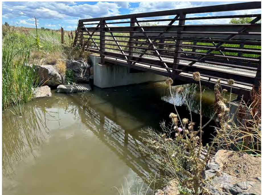
Stream back-up near middle crossing created by debris clogging