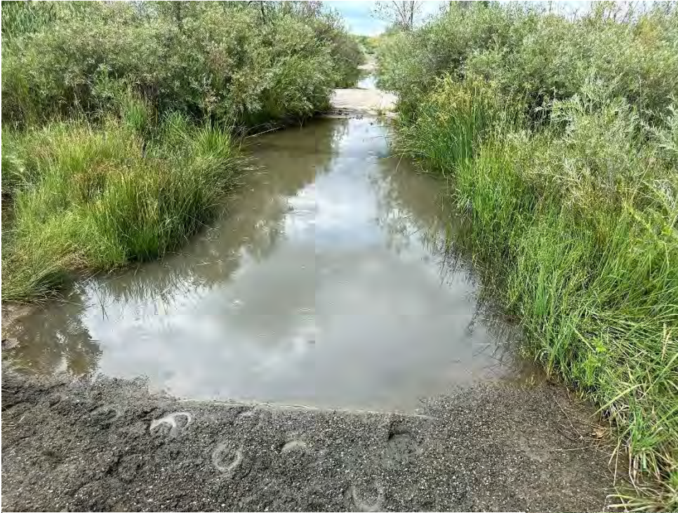
Stream back-up at southern-most stream crossing