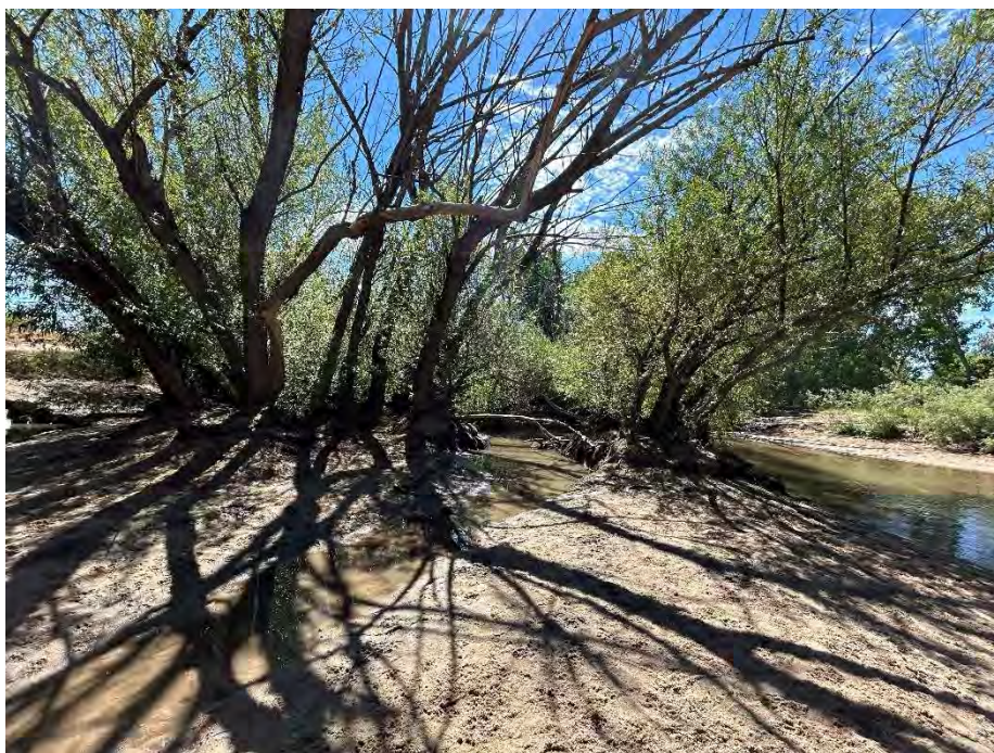
Tree islands caused by extreme bed scour