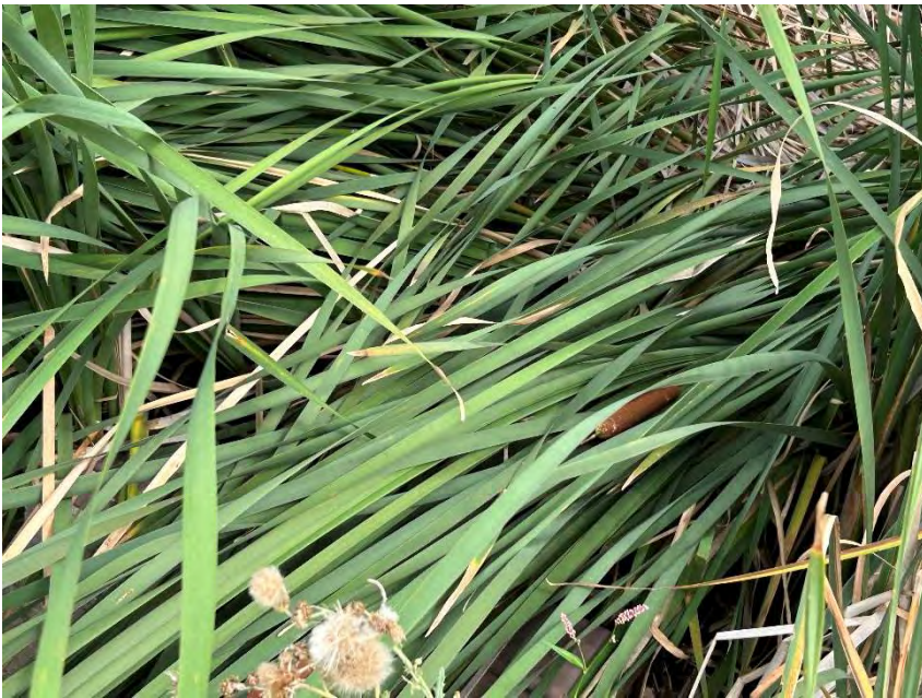
Drop No. 4 Outlet