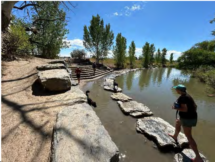
Behind-the-boulder edging erosion at the fourth access point

All three phases of the project were inspected from upstream to downstream, beginning at the first access point. Overall, no additional damage other than what occurred in the storms in May and June of 2023 was observed. The keys damage issues remain essentially the same as in 2023. Backfill in some of the erosion areas at the base of the access stairs would classify as needing maintenance attention, for pedestrian safety, the height from the bottom timber step to the ground surface being greater than the height from timber step to timber step. The water levels were higher in the area of the 4 th access point, flooding the eroded areas behind the boulder edging. This higher water is thought to be caused partially by the logjam downstream that was