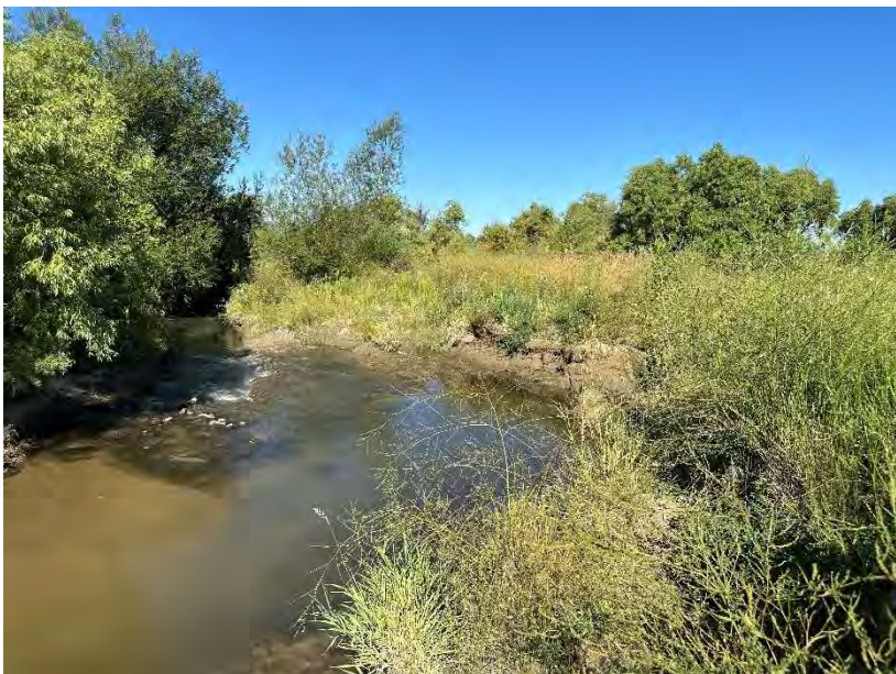
Downstream of the breakout area