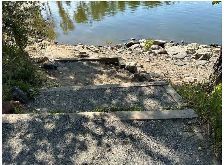
Access steps need CCSP maintenance